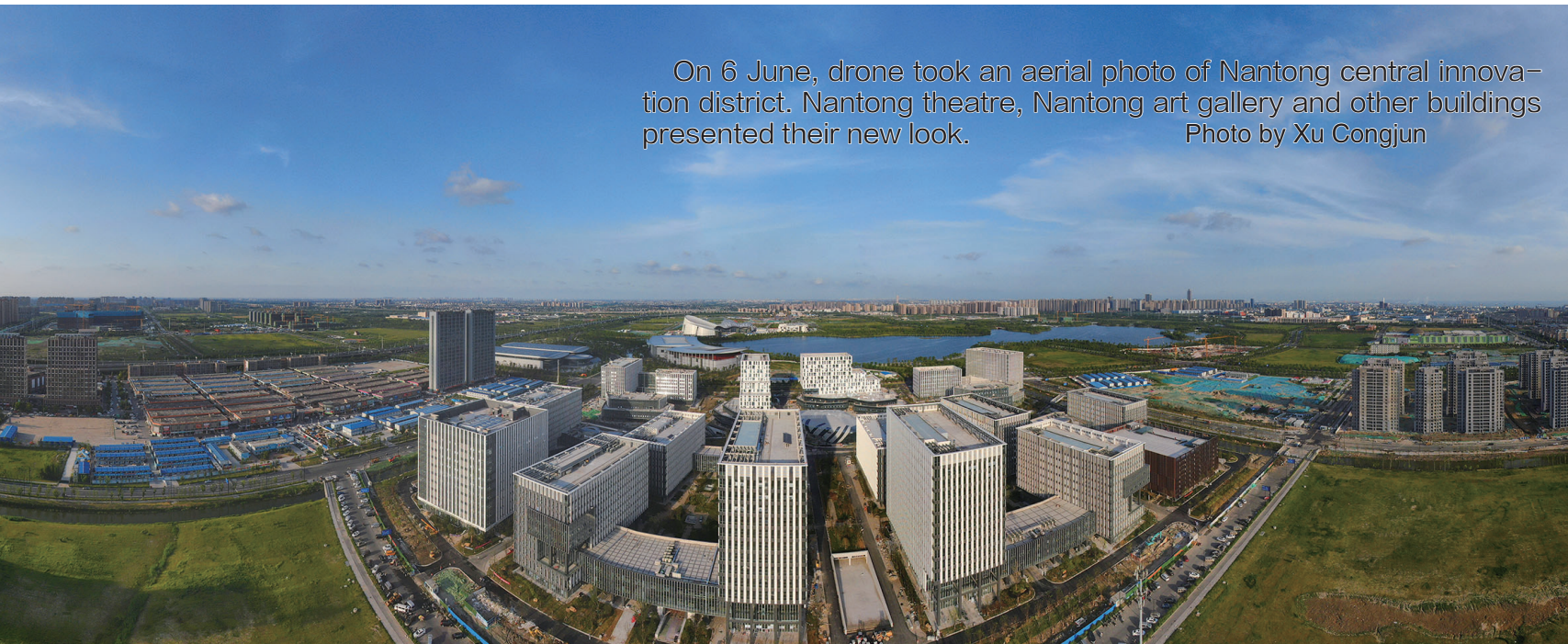
On 6 June, drone took an aerial photo of Nantong central innovation district. Nantong theatre, Nantong art gallery and other buildings presented their new look.

the group, including e-commerce, Alibaba cloud and finance. We hope that we can make Nantong the largest data center of Alibaba in East China to support the business growth in the next five years.'