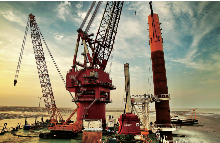
Offshore wind power construction site of Jiangsu Longyuan Zhenhua Marine Engineering Co., Ltd.

In terms of quality, Nantong has made significant progress. Nantong COSCO Shipping Engineering Co. Ltd. and Jiangsu Longyuan Zhenhua Marine Engineering Co., Ltd. won the 1st prizes as the 1st contractors. It is the 1st time Nantong companies won provincial science and technology award as the 1st contractors after 9 years.