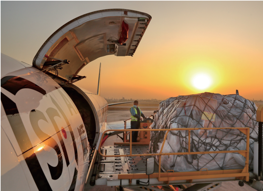
On 11 November morning, as a full loaded Boeing 757 full cargo plane of SF Airlines arrived at Nantong Xingdong International Airport, 8 full cargo planes have departed from or arrived at Nantong airport. They went to places including Quanzhou, Tianjin and Shenzhen. The amount of entry and exit cargo was 108 tons.