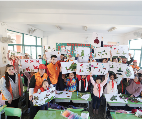
On 12 November, Chinese and foreign students of Nantong Vocational College of Science & Technology formed a volunteer team, led students of Second Affiliated Primary School to Nantong Normal School of Jiangsu Province to look for fallen leaves and make leave paste up pictures, let them feel the beauty of nature and welcome ‘International Students' Day’.

tomers, 70s take up 20.5% , right after them. This Tmall ‘double eleventh’, what types of goods are favored by Nantong residents? Relevant data shows that Nantong residents’ favorite goods is mobile phone. They occupy the first two of top 5 favorites of people of various age groups; down coat is also a ‘popular lover’, and is among the top 5 favorites of people of all age groups except 00s. In the aspect of Nantong residents’ favorite brands, Apple, Huawei, Midea, Saic Volkswagen, and Haier are popular.