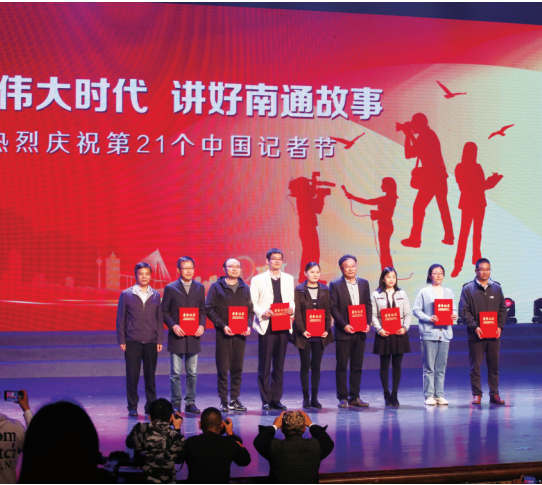
On 7 November, more than 300 representatives of Nantong press workers gathered to celebrate the 21st Chinese Journalists' Day.