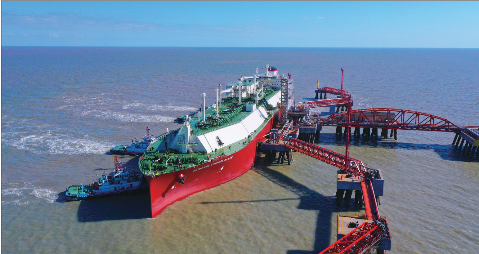
On 28 November, Yangkou harbour LNG port received the 500th berthing LNG transport ship ‘Alan’. At 5: 48 pm on that day, 4 unloading arms of China National Petroleum Corporation Jiangsu LNG receiving terminal were connected with ‘Alan’. 160 thousand cubic meters liquid natural gas from Australia were transported to gas pipe, and entered T-1201 gas storage tank on Yangguang island.

It is the 11th consecutive year Nantong held Jianghai talents entrepreneurship week. Apart from the opening ceremony, more than 10 theme events were held.