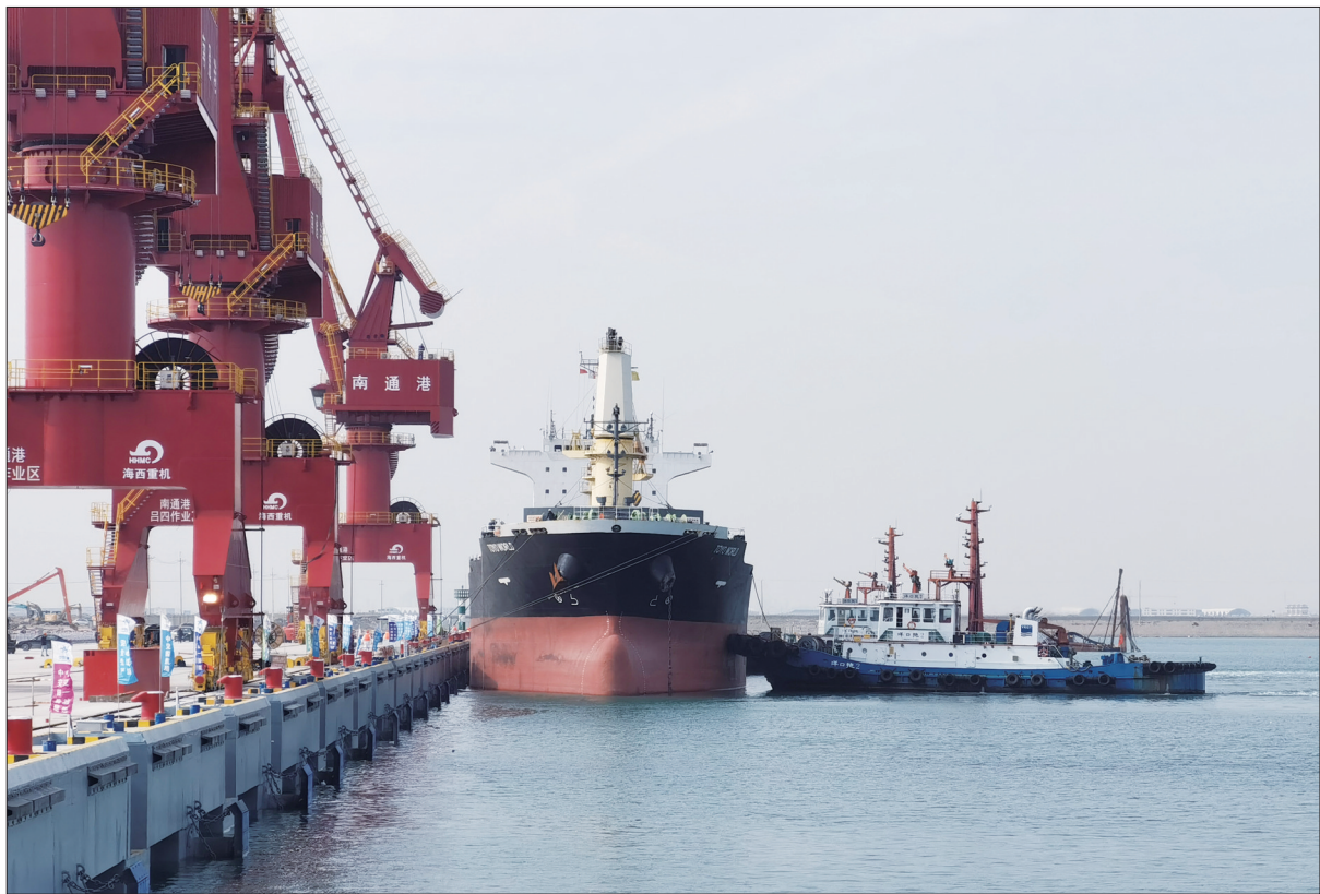
On 20 December 2021, Panama cargo ship ‘oriental world’ berthed at No.10 general berth of Tongzhou bay Lvsi start port area. It is the first time foreign ship berthed at Lvsi start port area.

Lvsi start port general wharf project was started on 29 June 2020. The total investment is about 1.605 billion Yuan. The length of the coastline is 556 m. The width of the wharf is 42 m.