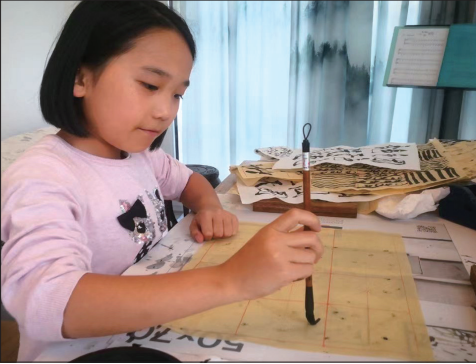
Practicing Chinese calligraphy with a writing brush