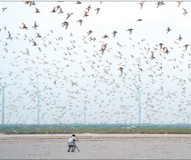
1 April is ‘International Bird Day’. The photo presents bird lovers watching birds.

‘Our major client is the world’s largest wind power operator - Vestas from Denmark. Our wind power blades were sold over the world by Vestas.’ Xie Yan said, ‘phase 1 project is mainly to serve overseas clients. In the present more than 80% of the products were sent to places all over the world from Dongzhao-gang port in Haimen port new area. At the same time manufacture for domestic clients was promoted. In the second half of the year, it is expected to produce more than 90 m even over 100 m level blade, to support offshore wind power products, and supply domestic market.’