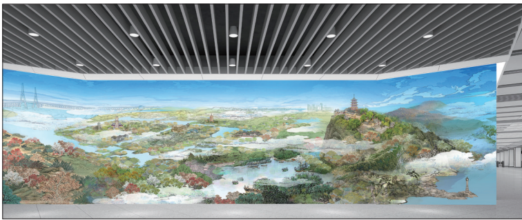
picturesque Jianghai effect drawing