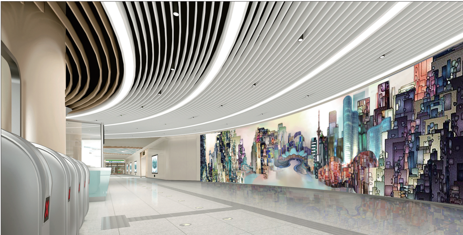
Thriving city effect drawing