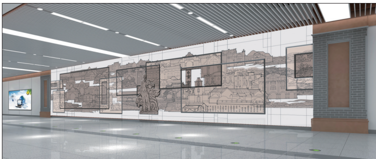
Zhang Jian culture effect drawing