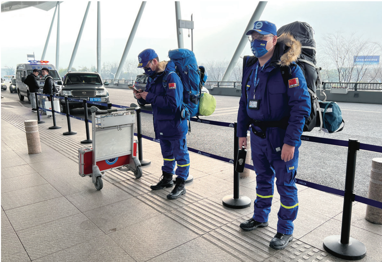
First batch of Lantian rescue team members were ready to set out for Malatya, Turkey.

On 8 February, it was a hive of activity at CIMC Pacific marine engineering at Qidong marine engineering and shipbuilding industrial park. In the present, the enterprise has close to 5 billion yuan of orders.