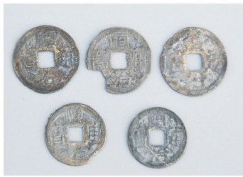
Ancient ship and some relics which were excavated

Ming dynasty water gate relic site and Qing dynasty ancient ship showed their true looks