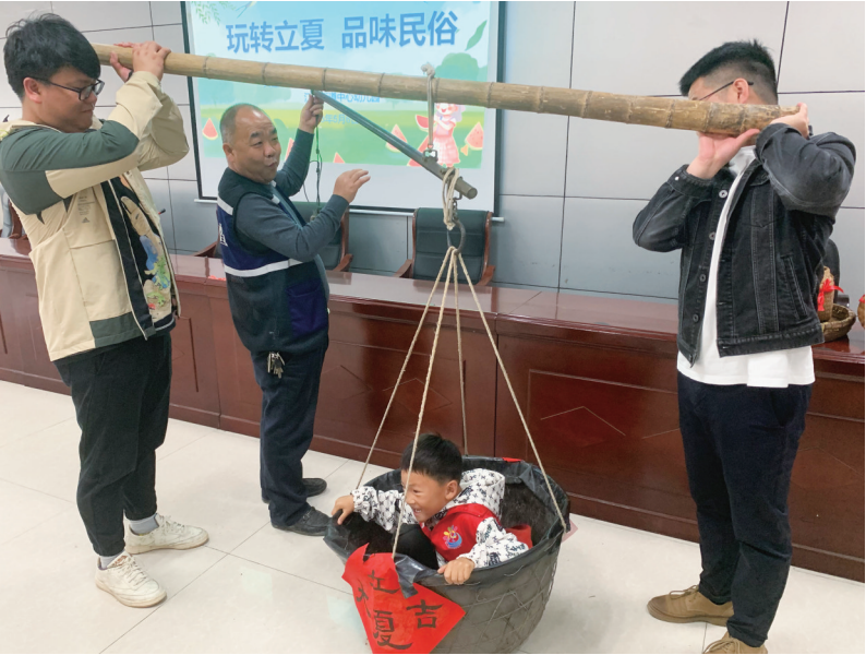
On 6 May, children sat in baskets and were weighed. On the day, Xinggangwan community, Jianghai streets, Suxitong industrial park held ‘experience folk culture of Beginning of Summer’ event, carried out activities such as egg fight and weighing of children.