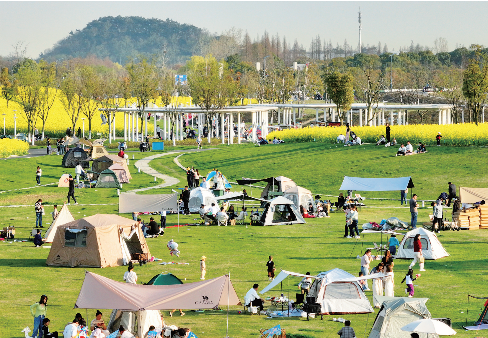
On 30th March, citizens were camping by the sea of rape flowers by the Yangtze River in Chongchuan District, experiencing the spring scenery.