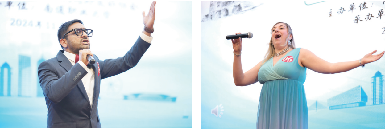
On 18th November, ‘China in the Foreign Voice—Nantong International Friends Singing Competition’ was held in Nantong Vocational University. Foreign friends from countries such as Italy, Uganda, Pakistan and Namibia used music to spread friendship, and tell wonderful Chinese stories together.