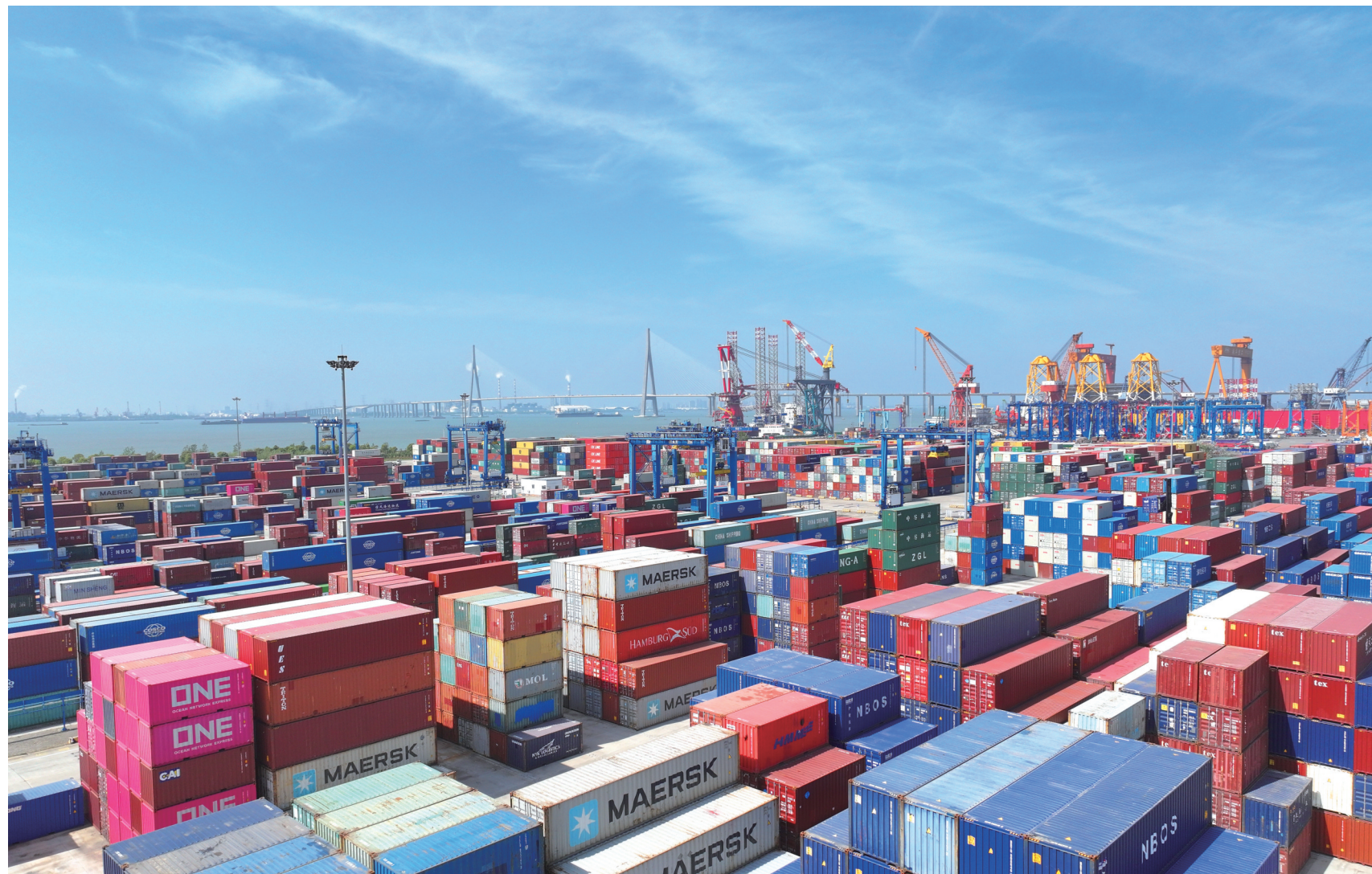
In the first quarter of 2025, Nantong Tonghai Port has completed a total container throughput of 405,312.5 TEUs, and there is an increase of 2.8%. The photo shows the container terminals and stacking yards of Nantong Tonghai Port Area taken on 20th April.